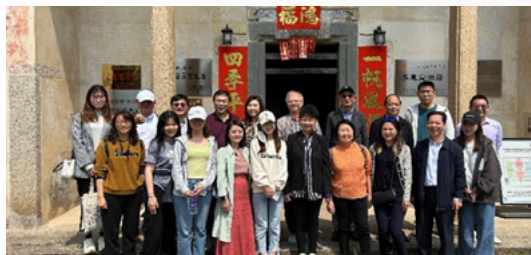
Study Tour on Hakka Cultural Heritage (2023) 客家文化傳承與發展交流團 (2023)

恒大提供多項學生交流計劃，包括國際交流項目及暑期海外交流計劃，旨在推動同學全人發展。學生亦可參加由傳播學院舉辦的本地及海外實地考察團，擴闊眼界。