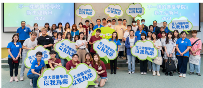
New Student Orientation 2023/24 of School of Communication 傳播學院新生迎新 2023/24