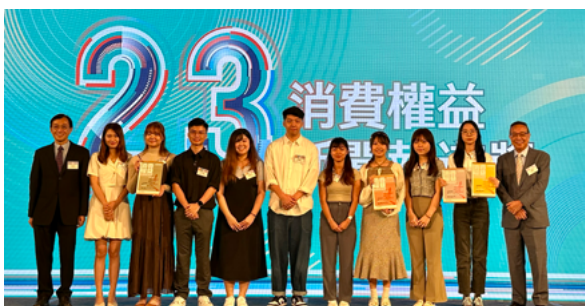
SCOM Students Won Award at the 23rd Consumer Rights Reporting Awards (2023) 傳播學院同學於第 23 屆「消費權益新聞報道獎」獲得獎項 (2023)