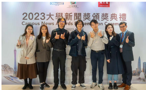
SCOM Students Won Two Awards in China Daily Campus News Awards 2023 傳播學院奪得《中國日報》「2023 大學新聞獎」兩個獎項