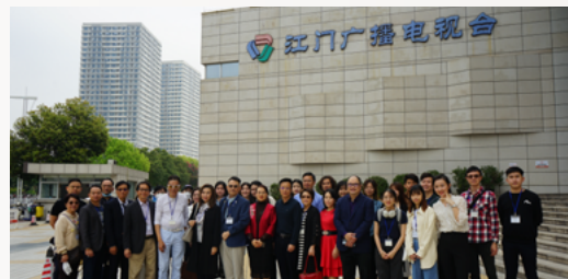
Field Visit to Jiangmen (2023) 江門參訪團 (2023)