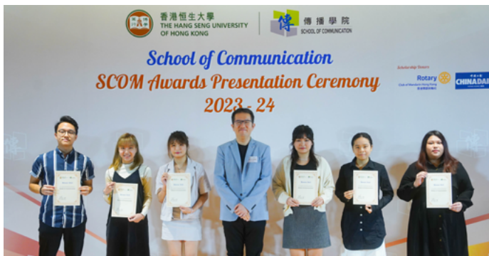
SCOM Awards Presentation Ceremony 2023-24 傳播學院學業成就獎頒獎典禮 2023-24