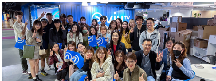
Teachers and Students Visiting ViuTV (2023) 傳播學院師生參觀 ViuTV (2023)