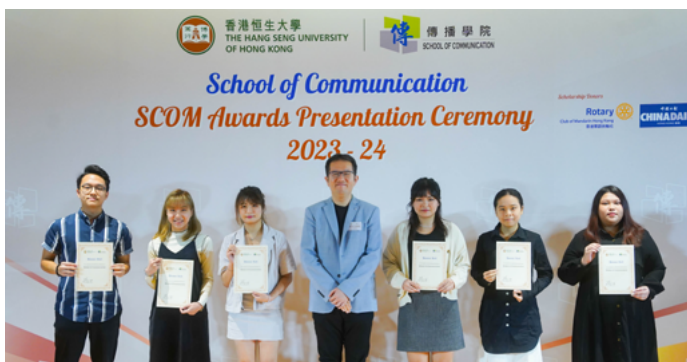
SCOM Awards Presentation Ceremony 2023-24 傳播學院學業成就獎頒獎典禮 2023-24