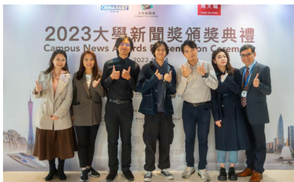
SCOM Students Won Two Awards in China Daily Campus News Awards 2023 傳播學院奪得《中國日報》「2023 大學新聞獎」兩個獎項