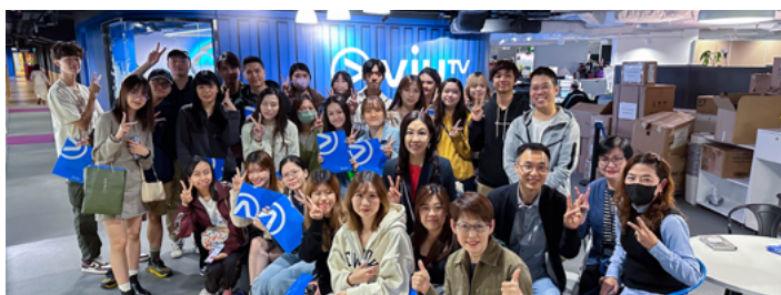
Teachers and Students Visiting ViuTV (2023) 傳播學院師生參觀 ViuTV (2023)