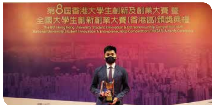
The 8th Hong Kong University Student Innovation and Entrepreneurship Competition - Third Prize in Social Enterprise /Cultural & Creative Services 第8屆香港大學生創新及創業大賽- 社企/文化創意三等獎