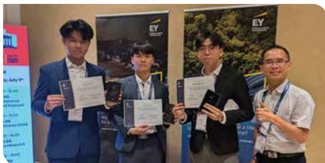
EY Open Science Data Challenge 2024 - Champion 安永開放科學數據挑戰賽 2024冠軍