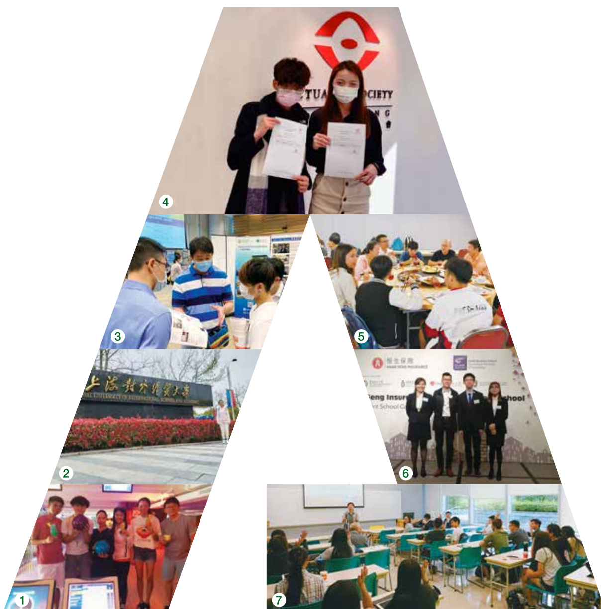
1 Mentorship Programme 師友計劃

為滿足市場對專業人才日益增長的需求，本課程獲納入教育局的指定專業/界別課程資助計劃。入讀本課程的本地學生，在課程的正常修業期內，每年可獲最高46,780港元學費資助。本資助計劃適用於一至三年級入讀之學生。