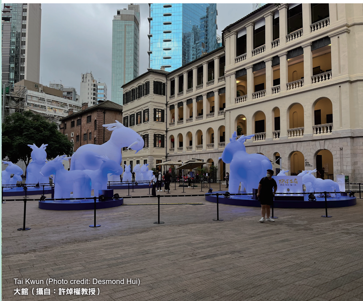
Tai Kwun 大館