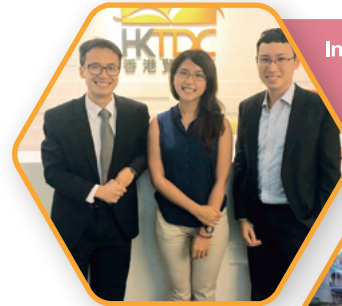
Internship Programme at The Hong Kong Trade Development Council