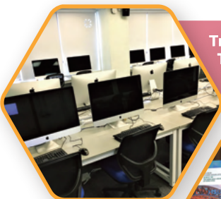
Translation Technology Workshop

Equipped with 31 iMac computers, our newly renovated Translation Technology Workshop provides state-of-the-art tools for professional translation and language services, including automatic translation systems, corpora, translation memories, terminology databases, multimedia processing platforms, and integrated translation systems. Students can get hands-on experience with computer-aided translation projects and keep abreast of the latest technological developments in the translation and language services industries.