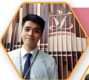
同學於立法會實習