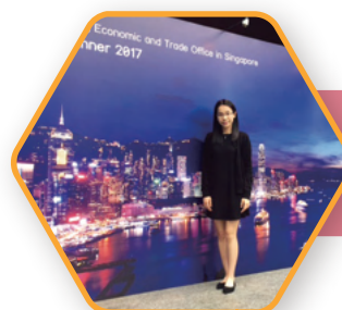
Internship Programme at Hong Kong Economic and Trade Office, Singapore