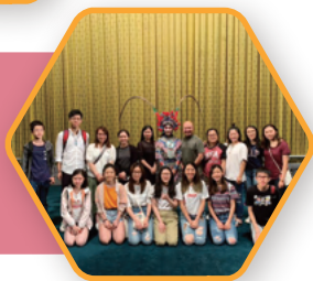
同學於北京 外國語大學 研習傳譯並 參與文化 交流活動