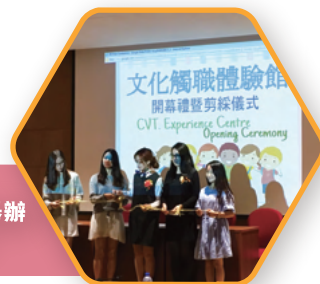
公關翻譯科每年舉辦 模擬新聞發佈會

為拓展學生國際視野，促進對語文及文化的認知，學院為課程新增第二外語要求，並且開辦一系列歐亞語言課程。日常課堂以外，學院更舉辦各類活動，提升學生對語文及文化的興趣，活動包括北歐文化節及恒大總領事講座系列。