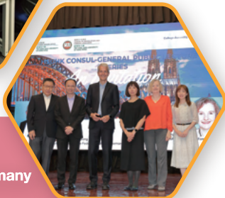
HSUHK Consul General Series: An Invitation to Germany