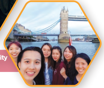
Overseas Studies at University of Westminster (London)