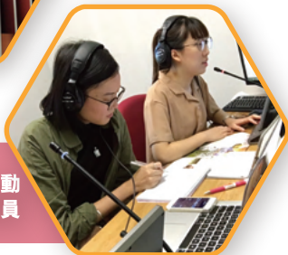
同學於學院活動 擔任即時傳譯員