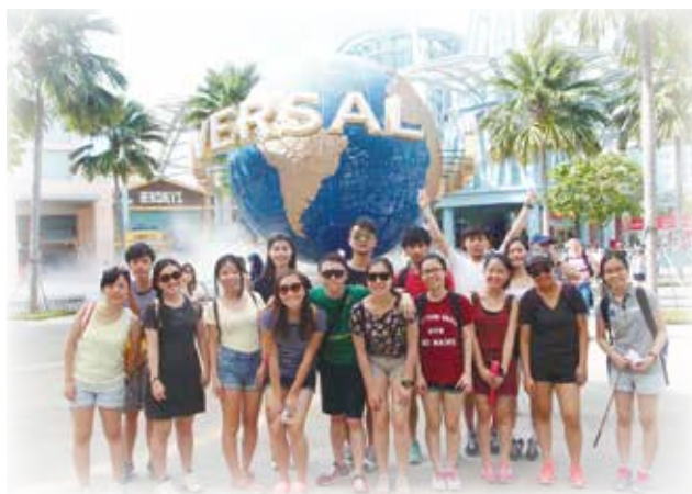
Summer breeze hits BA in English students in Singapore

The University offers exchange opportunities to students to increase their exposure in diverse cultures and cultivate their identity as global citizens. The Department also offers short-term summer exchange programmes and cultural tours around the world.