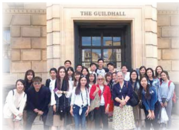
Students visit the UK to explore the historic city of London