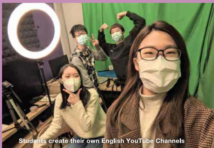
Students create their own English YouTube Channels