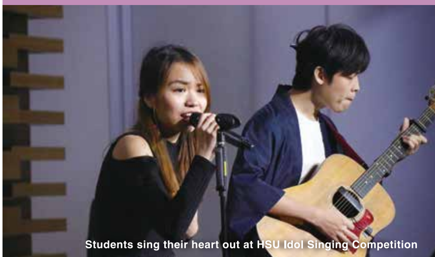
Students sing their heart out at HSU Idol Singing Competition

The English Language Centre (ELC) aims to help students enhance their English language skills. We provide tutoring services, English-language workshops, and cultural literacy activities, as well as a computer laboratory, a consultation/study room, and a variety of multimedia self-access materials. The workshops cover topics ranging from practical use of English to cultural lessons about various English-speaking societies. Additional activities include singing contests, reading groups, dramatic duologue competitions, movie nights, and seminars by guest speakers. Each of these opportunities allows students to brush up on their language proficiency and to broaden their cultural horizons.