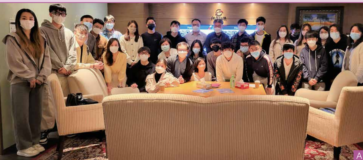
A Company Visit and Career Talk 公司參觀和職業講座