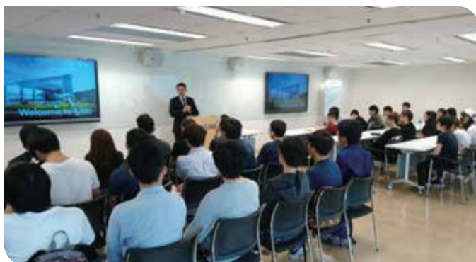
SAS Institute Inc