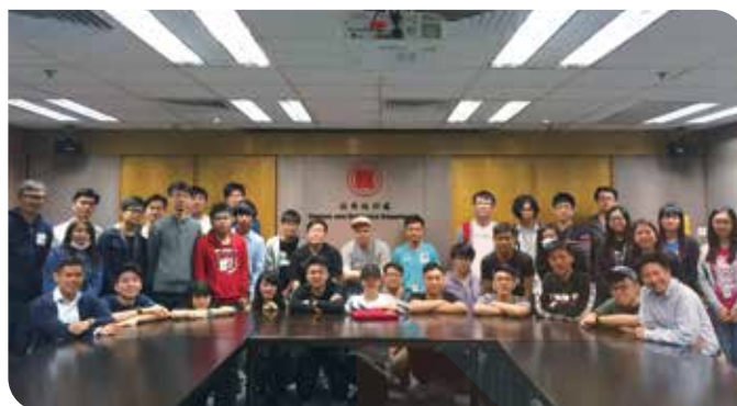
Census and Statistics Department 政府統計處