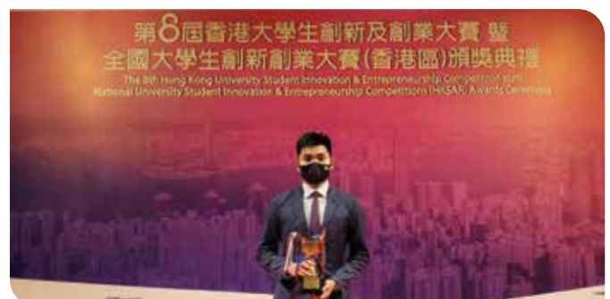
The 8th Hong Kong University Student Innovation and Entrepreneurship Competition - Third Prize in Social Enterprise /Cultural & Creative Services 第8屆香港大學生創新及創業大賽- 社企/文化創意三等獎