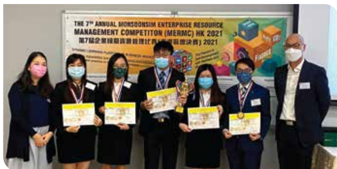
MonsoonSIM Enterprise Resource Management (Online Business Simulation Game) Hong Kong Competition 2021 – 2nd Runner Up MonsoonSIM第七屆企業模擬資源管理比賽(香港區總決賽)2021季軍