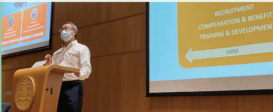
HR Seminar 人力資源座談會