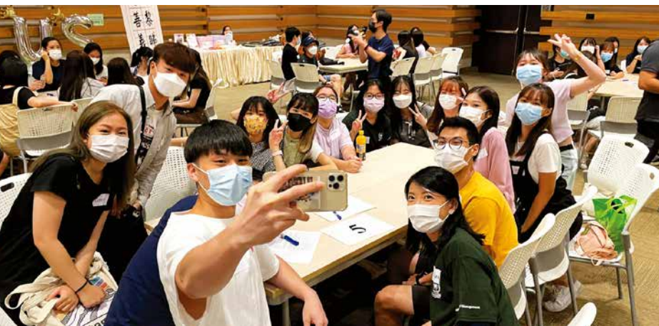
New Students Orientation Day 新生迎新日