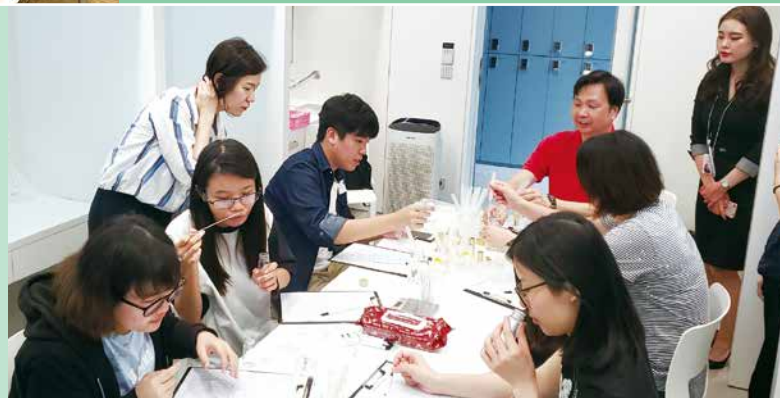
Firm Visit in Seoul (Amore Pacific) 韓國首爾參觀化妝品企業（愛茉莉太平洋）