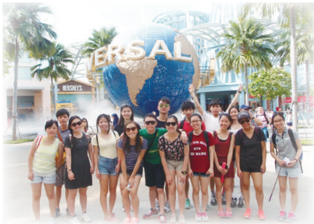
Summer breeze hits BA in English students in Singapore

The University offers exchange opportunities to students to increase their exposure in diverse cultures and cultivate their identity as global citizens. The Department also offers short-term summer exchange programmes and cultural tours around the world.