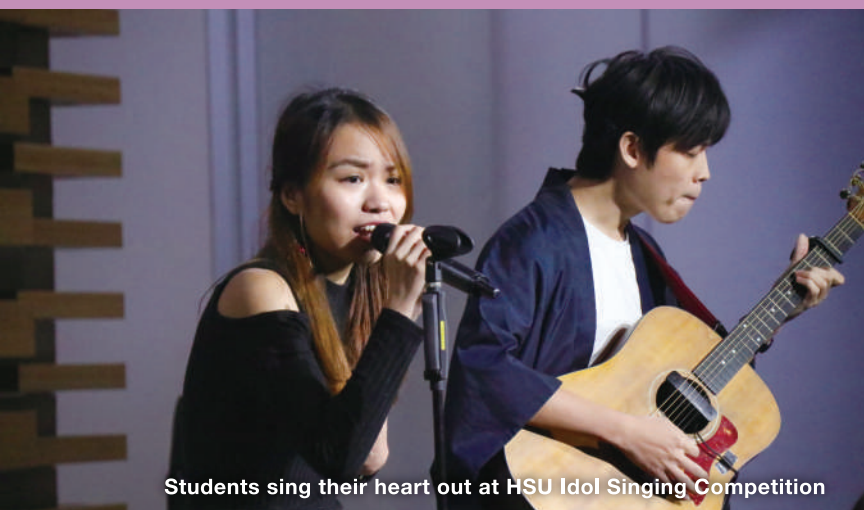
Students sing their heart out at HSU Idol Singing Competition

The English Language Centre (ELC) aims to help students enhance their English language skills. We provide tutoring services, English-language workshops, and cultural literacy activities, as well as a computer laboratory, a consultation/study room, and a variety of multimedia self-access materials. The workshops cover topics ranging from practical use of English to cultural lessons about various English-speaking societies. Additional activities include singing contests, reading groups, dramatic duologue competitions, movie nights, and seminars by guest speakers. Each of these opportunities allows students to brush up on their language proficiency and to broaden their cultural horizons.