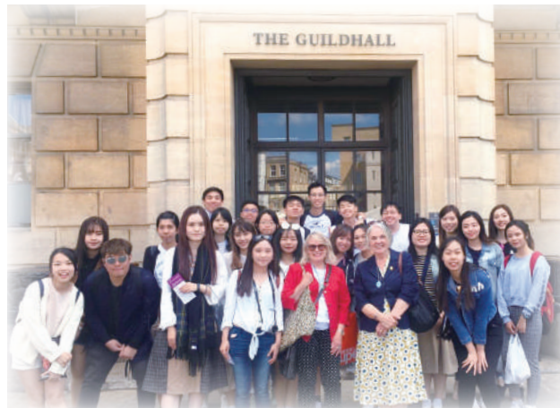
Students visit the UK to explore the historic city of London