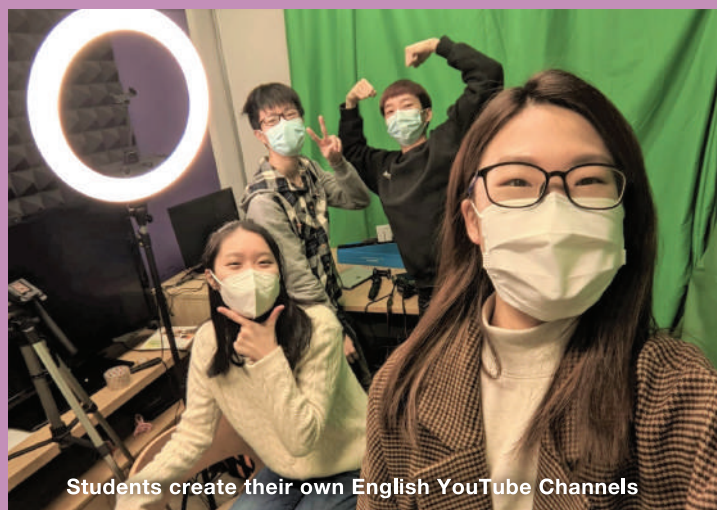
Students create their own English YouTube Channels