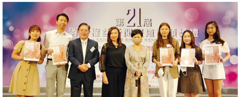
Students won the Bronze Award in the 21st Consumer Rights Reporting Awards. 同學於第21屆消費權益新聞報導獎比賽獲得銅獎。