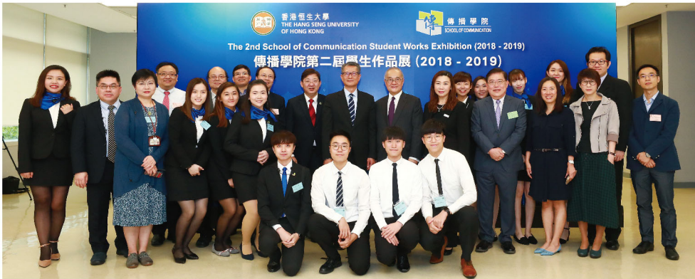
The 2nd School of Communication Students Works Exhibition 傳播學院第二屆學生作品展