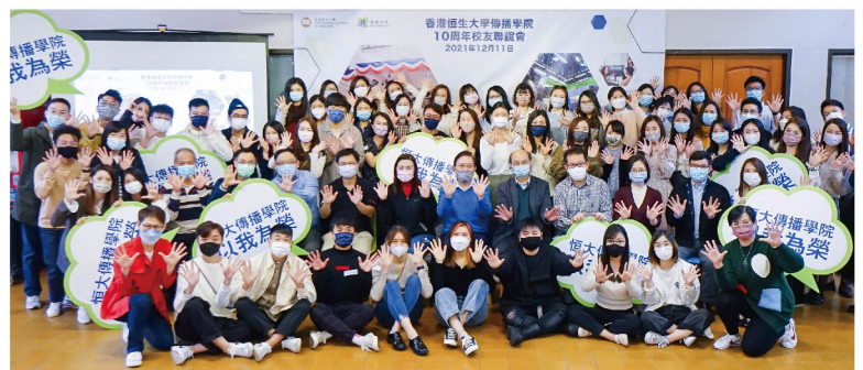
Alumni Gathering of the School of Communication. 傳播學院校友聯誼會。