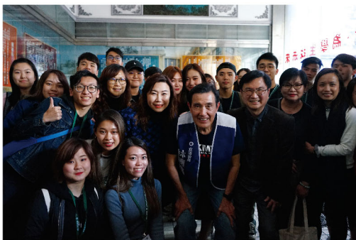
Teachers and Students took photo with Taiwan Former President Ma Ying-jeou. 台灣前總統馬英九與傳播學院考察團合照。