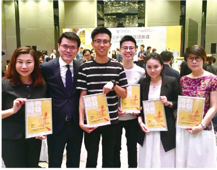
Students who were awarded in the 18th Consumer Rights Reporting Awards took photo with the Secretary for Commerce and Economic Development, Mr Edward Yau Tang Wah (2nd from left).

於第18屆消費權益新聞報導獎比賽獲獎的同學與商務及經濟發展局局長邱騰華先生(左二)合照。